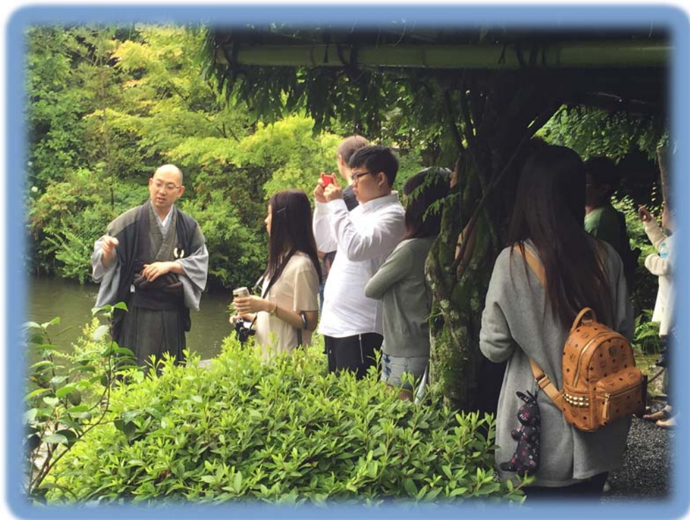
Lecture by Zen Monk