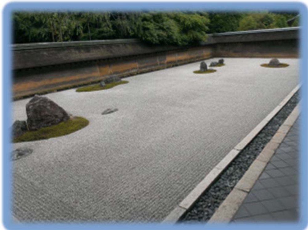
Zen Rock Garden