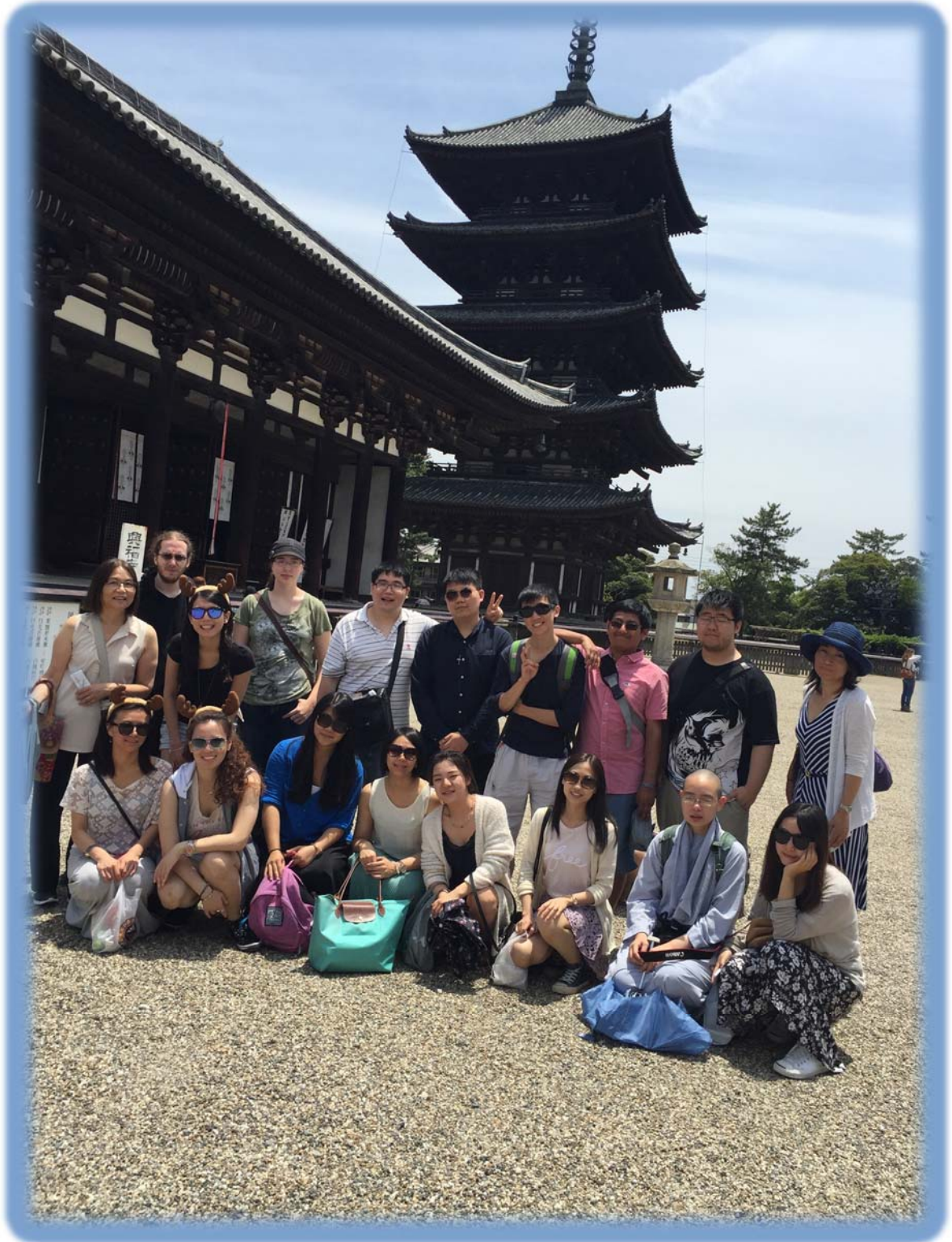
Kofukuji in Nara