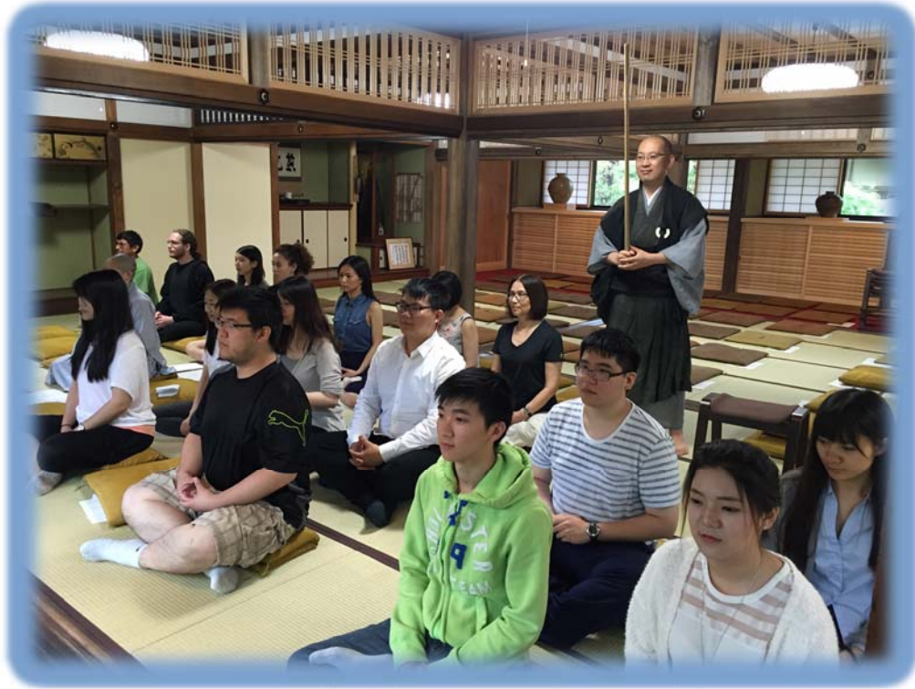
Zazen (meditation) as a part of Zen Workshop