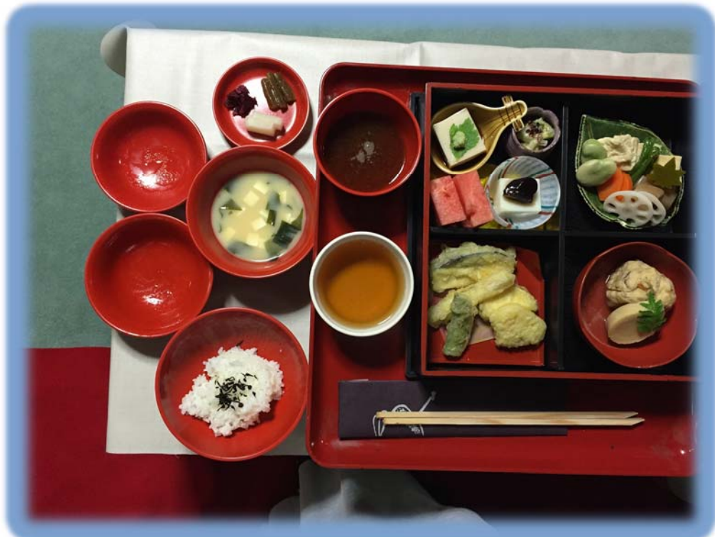
Workshop of Japanese traditional sweets