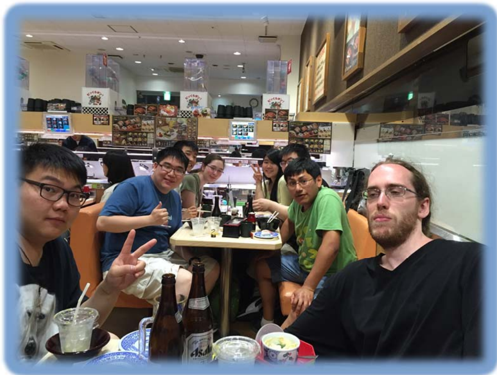
At "Susi-Train" restaurant. We ate so much....