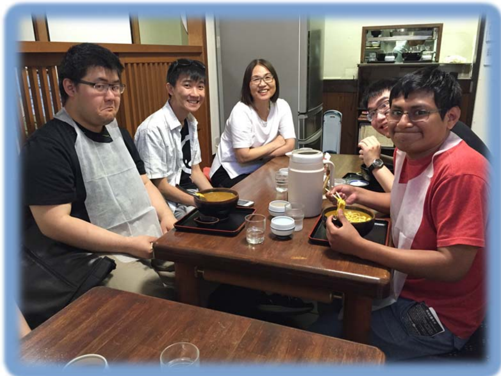
At a restaurant specialized in "curry flavored" udon