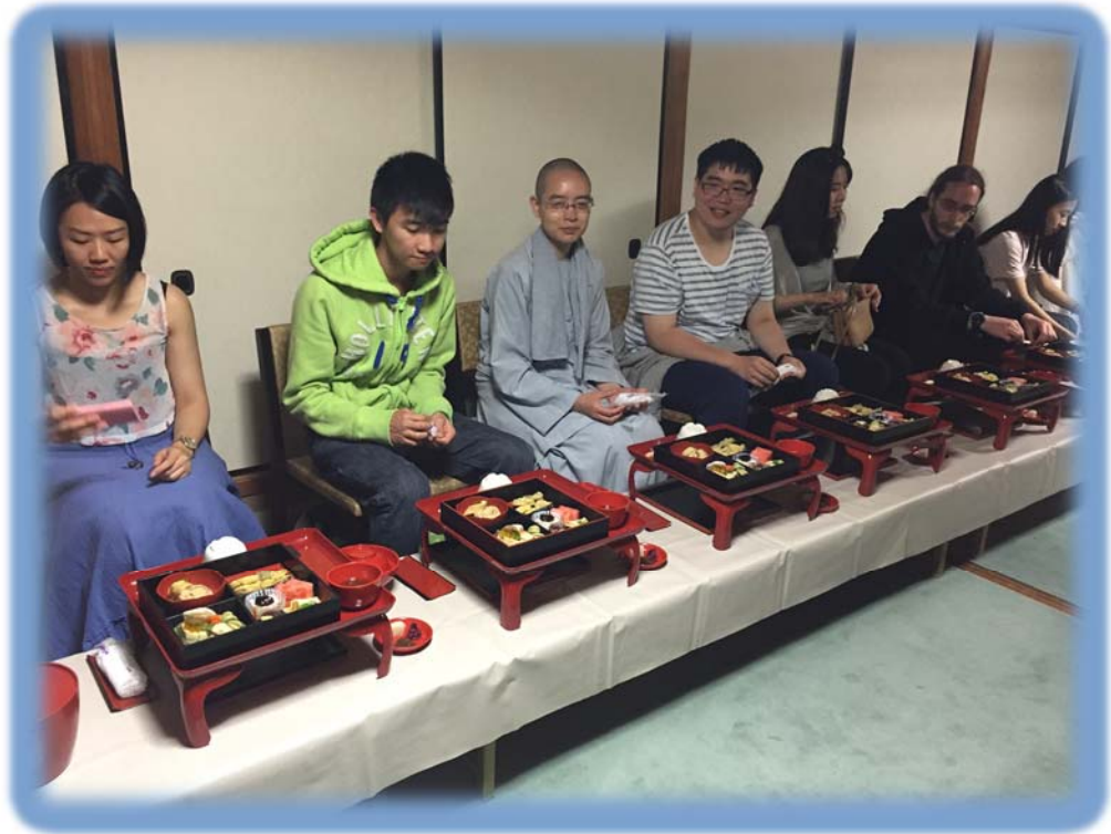
Eating Shojin Ryori (vegetarian cuisine originally derived from the dietary restrictions of Buddhist monks)