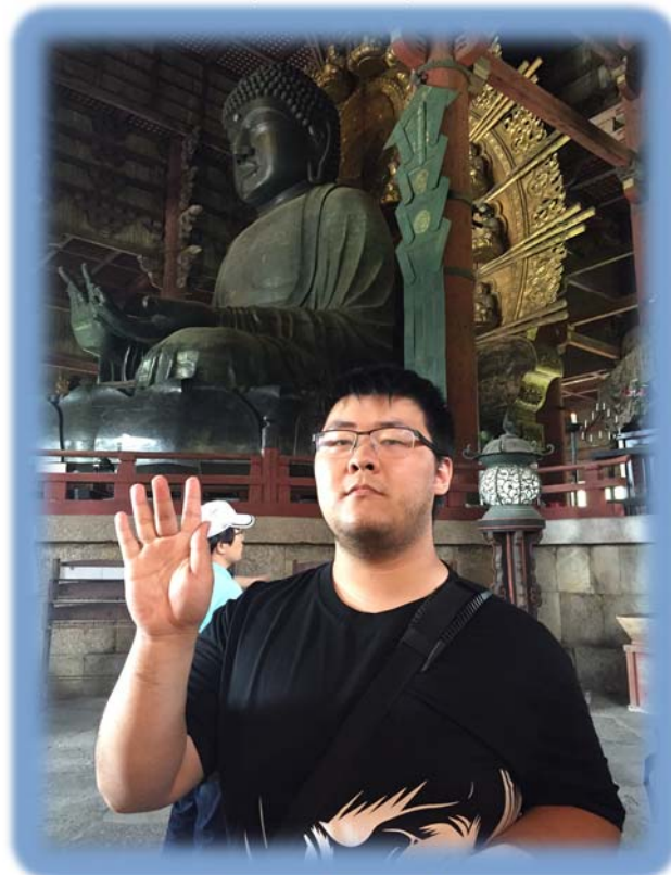
Big Buddha in Nara