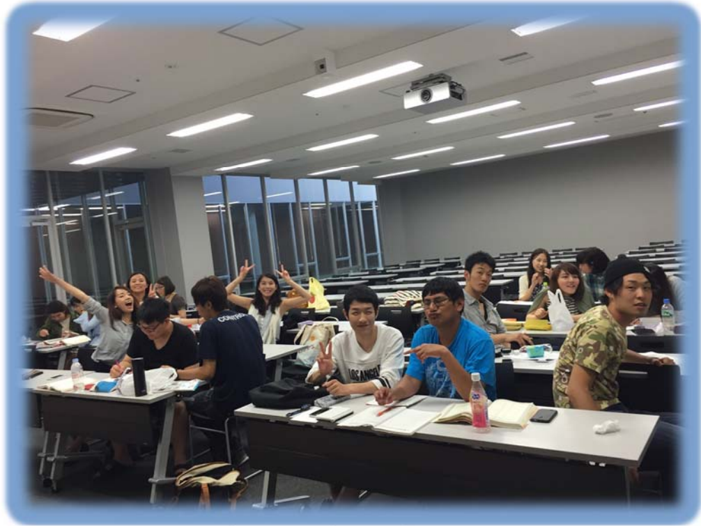
Japanese language class with Japanese tutors