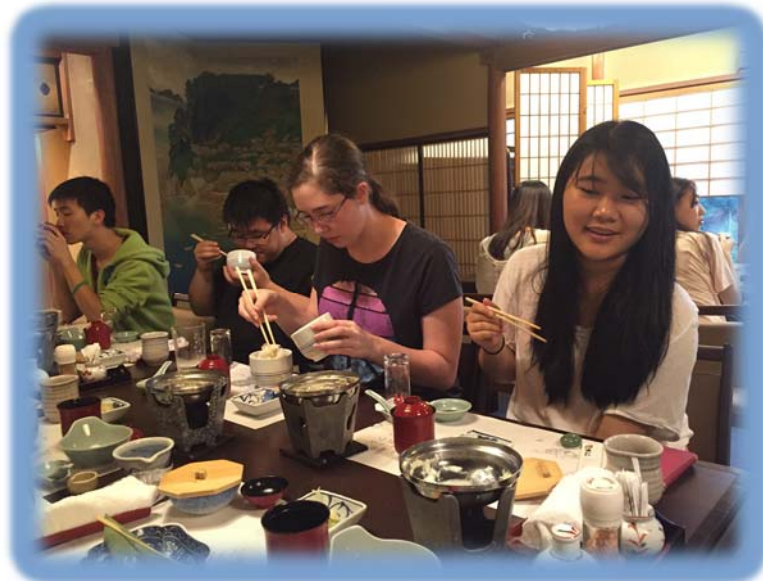
A full-course meal of traditional Japanese cuisine in a traditional setting