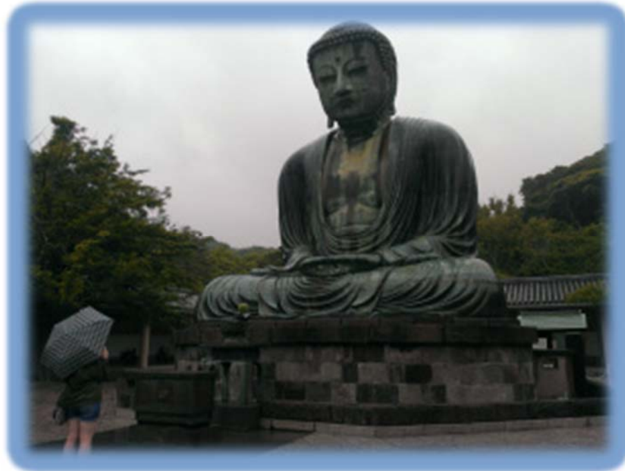
Big Buddha in Kamakura