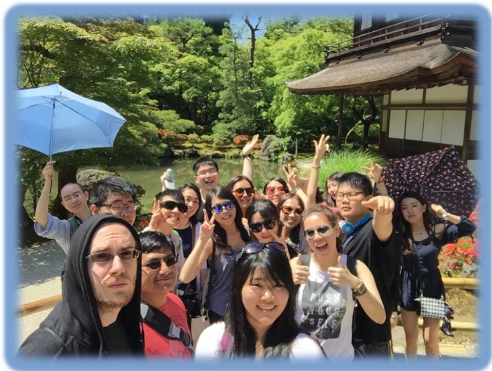
Ginkaku-Ji (The Silver Pavilion)