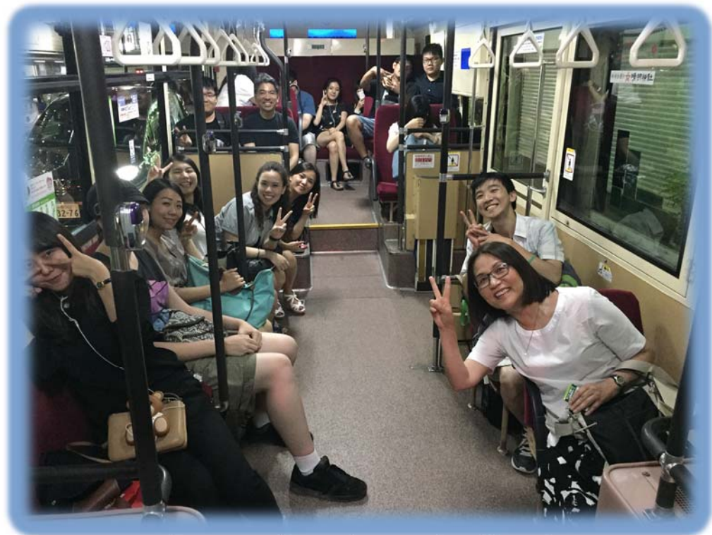
A rare experience--An empty bus all to us!