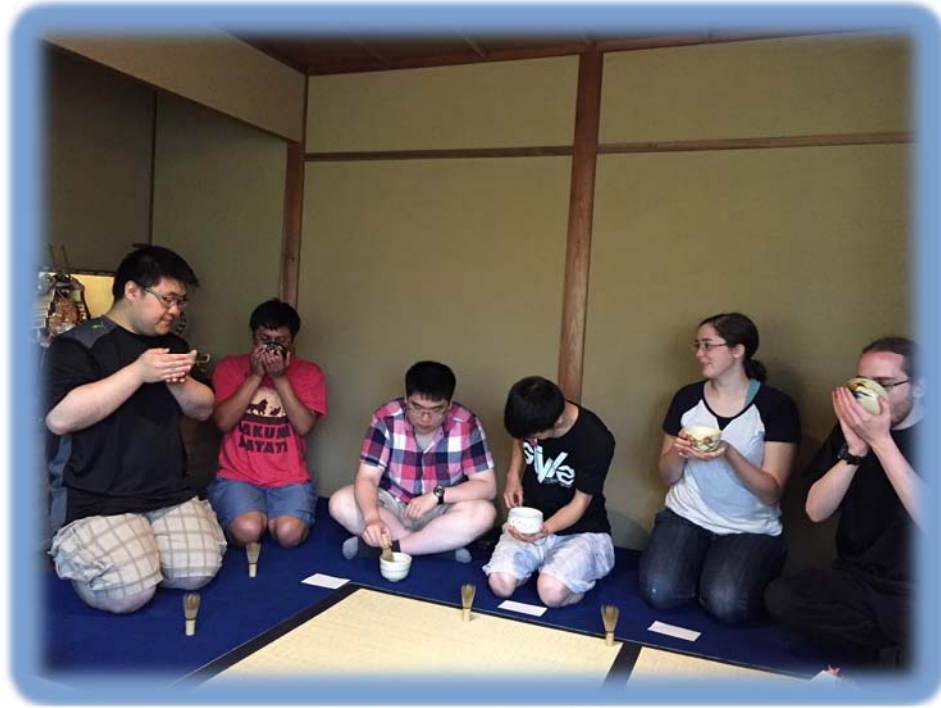
Tea Ceremony Workshop