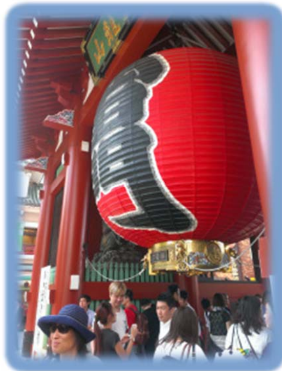
Asakusa in downtown Tokyo