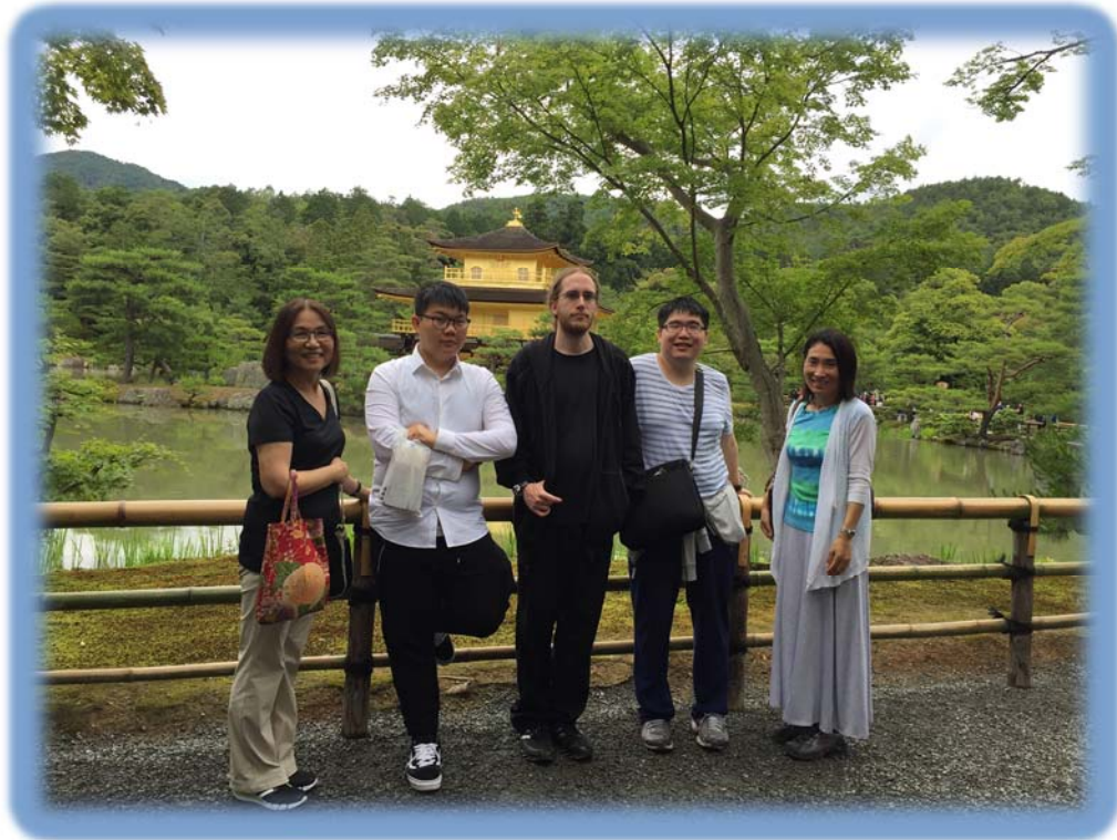
Kinkaku-Ji (The Golden Pavilion)