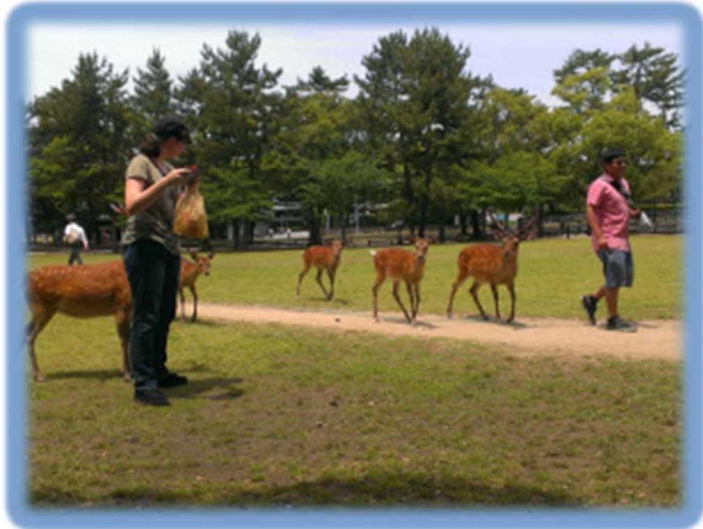
“Sacred” and cute deer at Nara Park