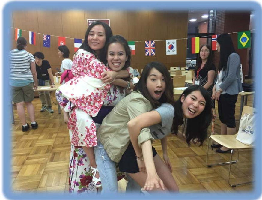
FARAWELL PARTY AT RYUKOKU UNIVESRITY