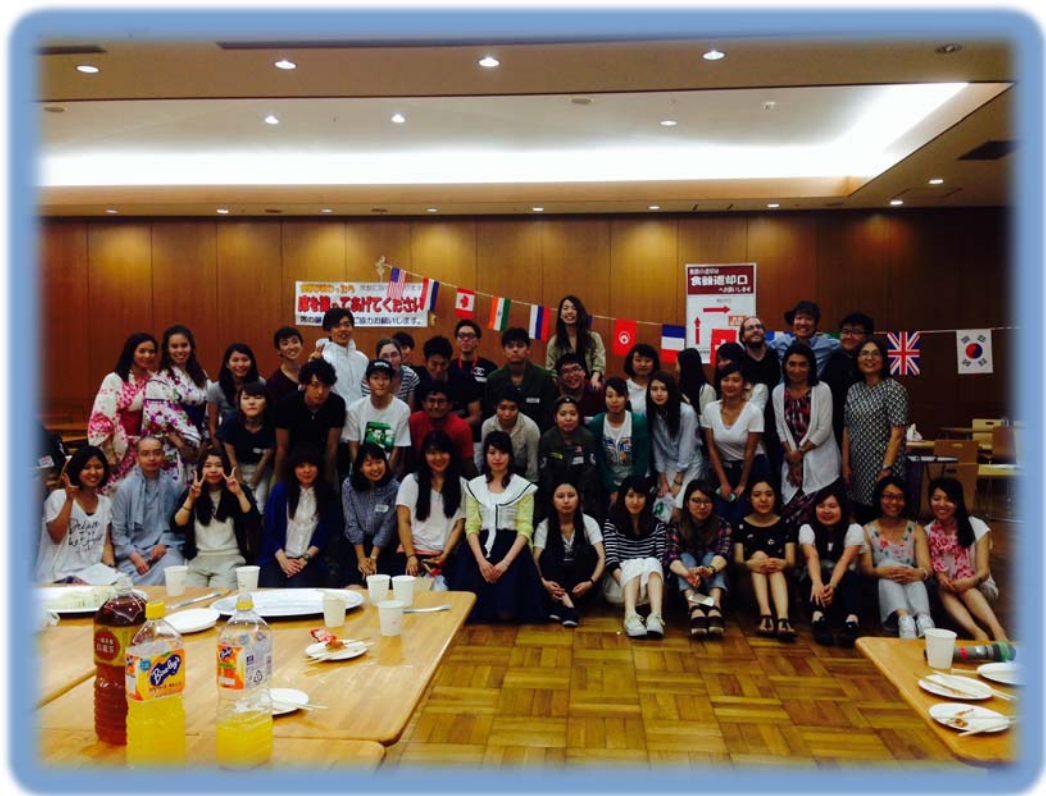
The Last Day in Japan (with Ryukoku University students)